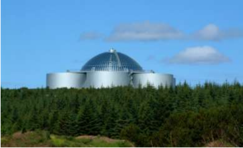
• Reykjavík district heating system