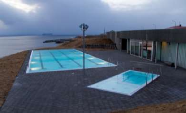
• Hofsós swimming pool