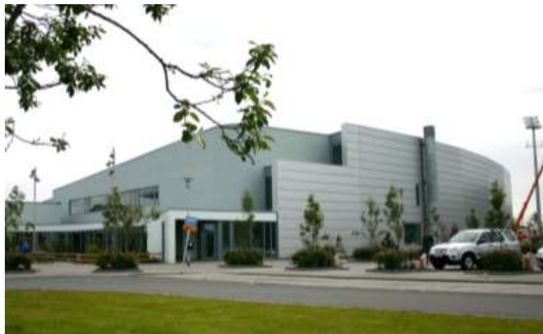
• Laugar – Health and Sport Center