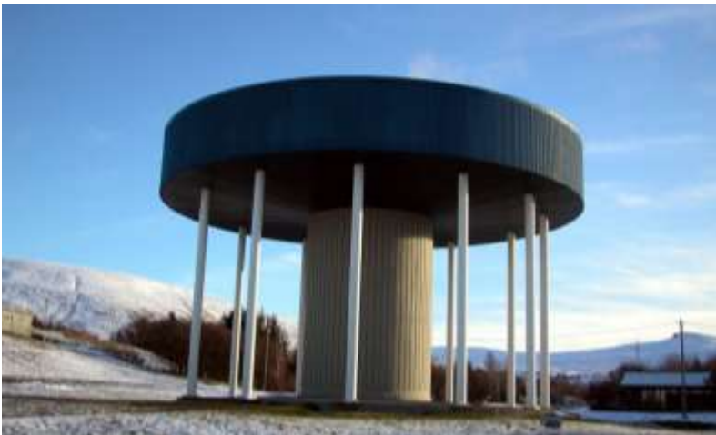
• Reykir main pipeline hot water