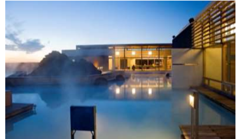
• Blue Lagoon Spa og Health center