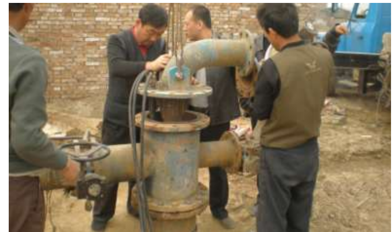
• Xiang Yang district heating system