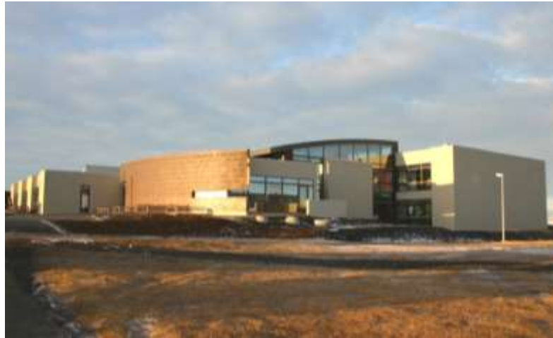
• Ingunnarskóli – Primary School