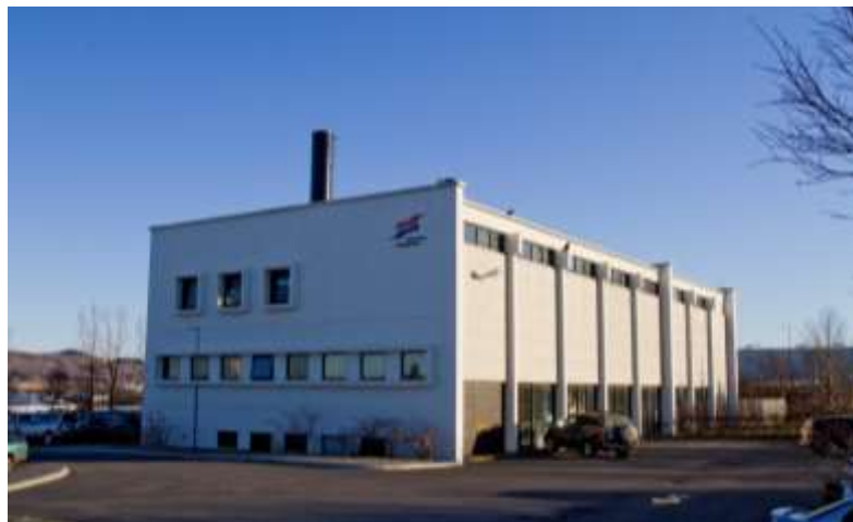
• Árbær pumping station