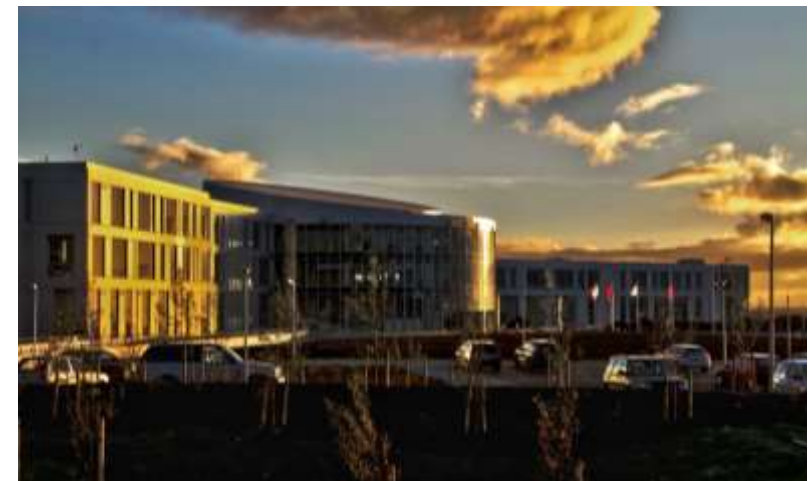
• Reykjavik University