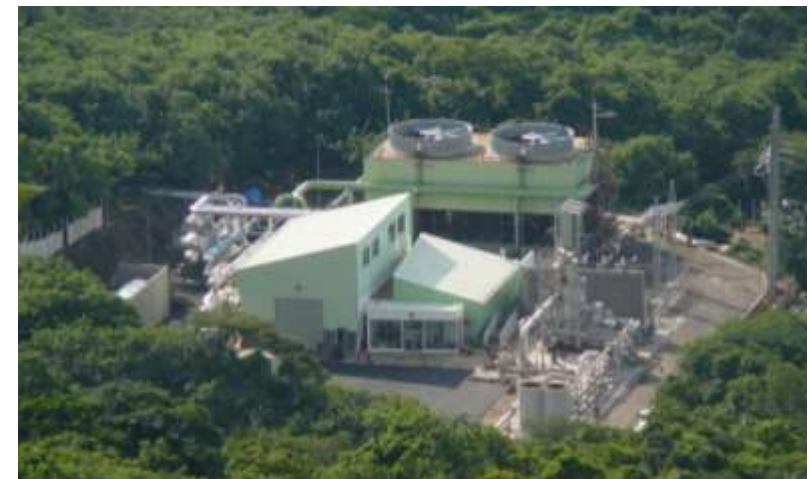
• El Salvador