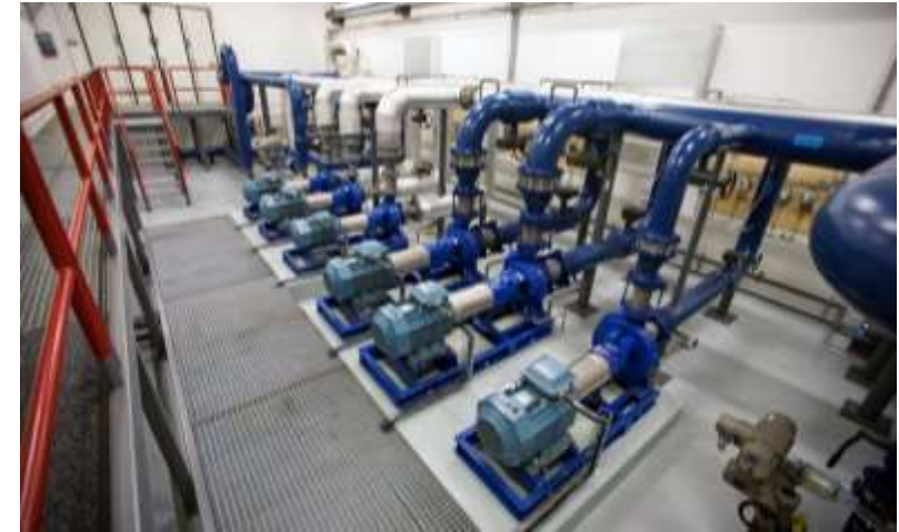
• Vatnsendi pumping station