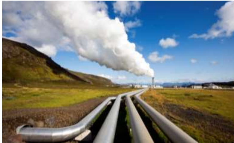
• Nesjavellir main pipeline hot water