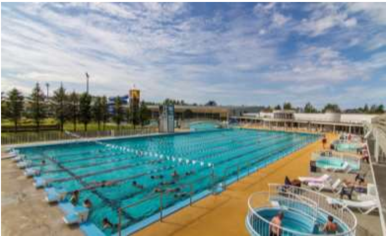
• Laugardalur Swim and Sport center