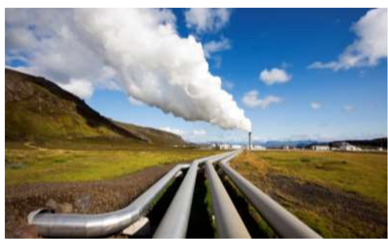
Nesjavellir main pipeline hot water