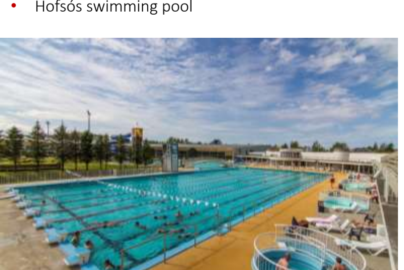
Laugardalur Swim and Sport center