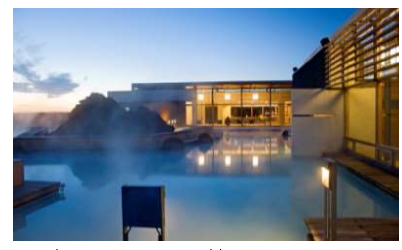
Blue Lagoon Spa og Health center