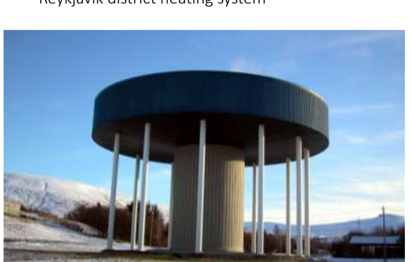
Reykir main pipeline hot water