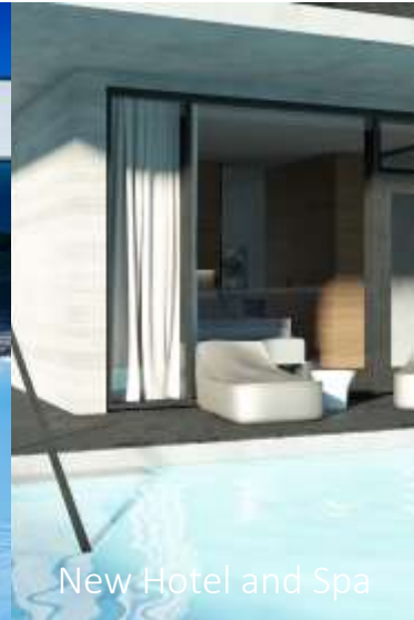
New Hotel and Spa