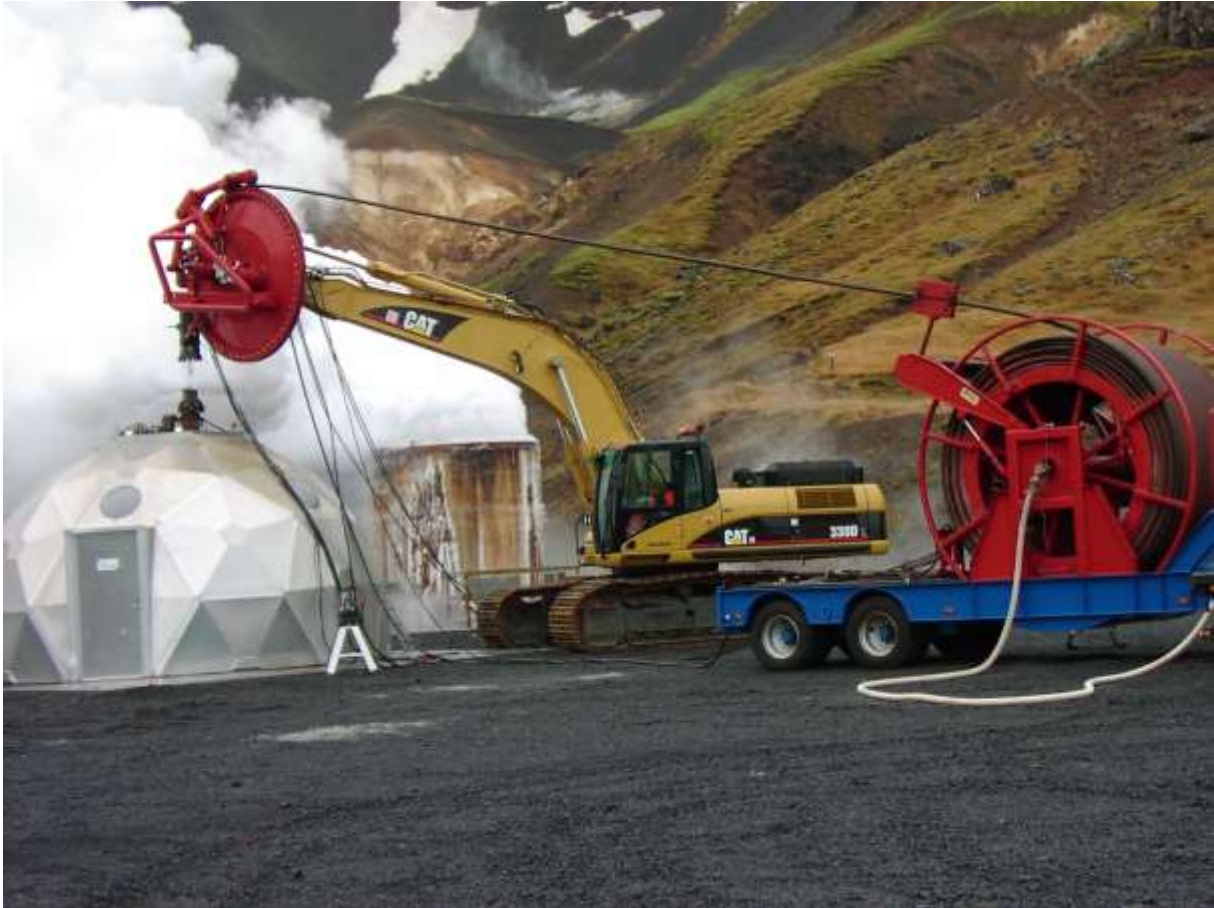
„Soft starting“ a hi-temp geothermal well in Hellisheiði. „Home made“ equipment again.