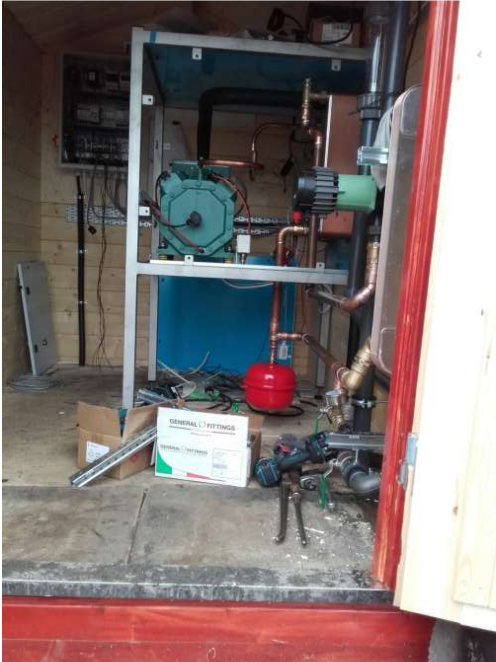
Installing a „home made“ heat pump in Vagnsstadir in SE Iceland. The well water is slightly brackish, 11°C.