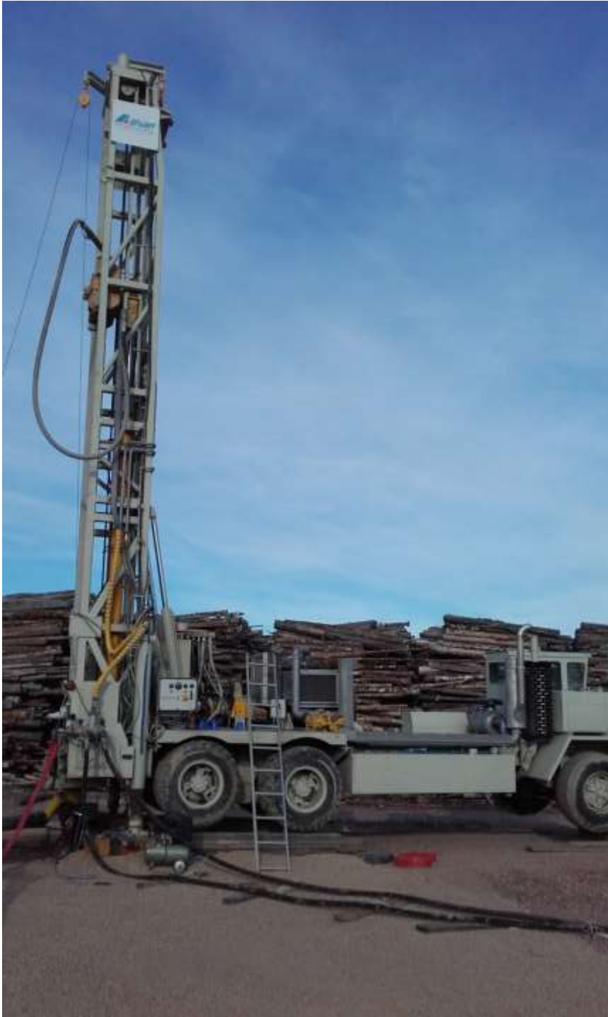
Drilling a 700 m well with a larger machine in hard and abrasive rock by the lake Siljan in Sweden 2015.